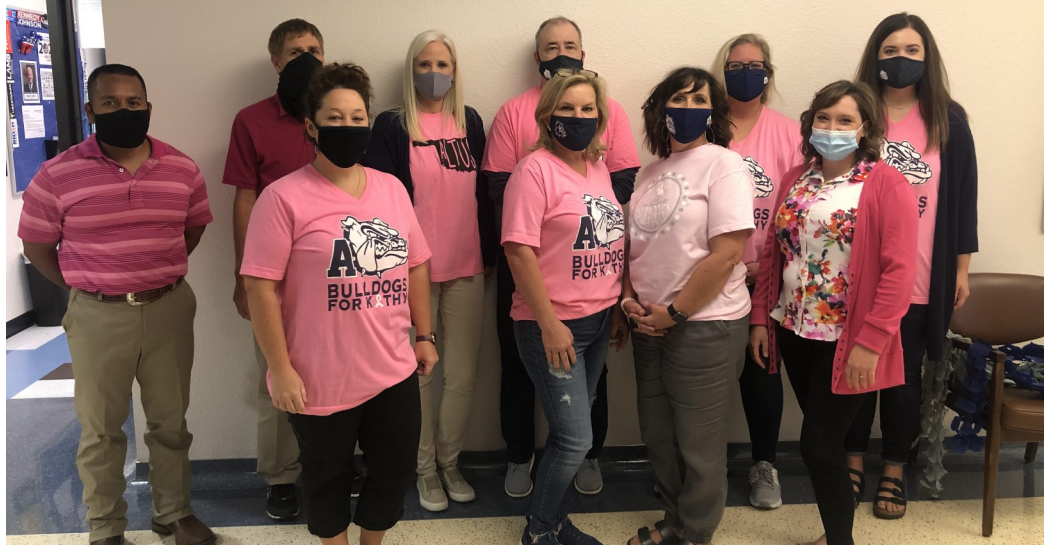
Teachers wore pink for Breast Cancer Awareness month.