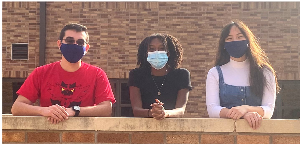
Senior NHS Officers.

They also have plans to sell Candy Grams this year. Other activities they plan to do include: tutoring services, Freerice.com, operation care,