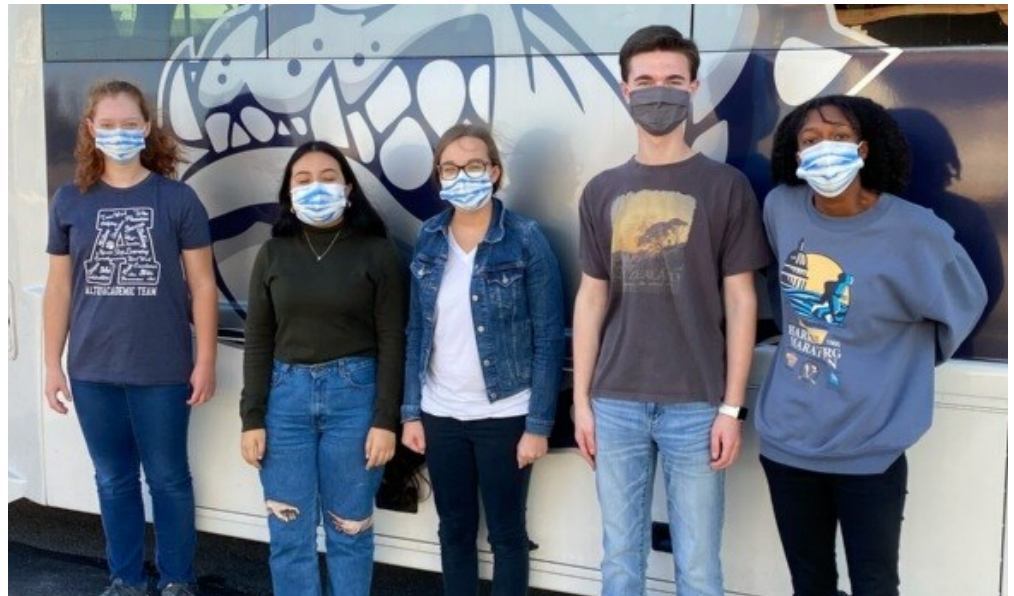
Academic Team Members.