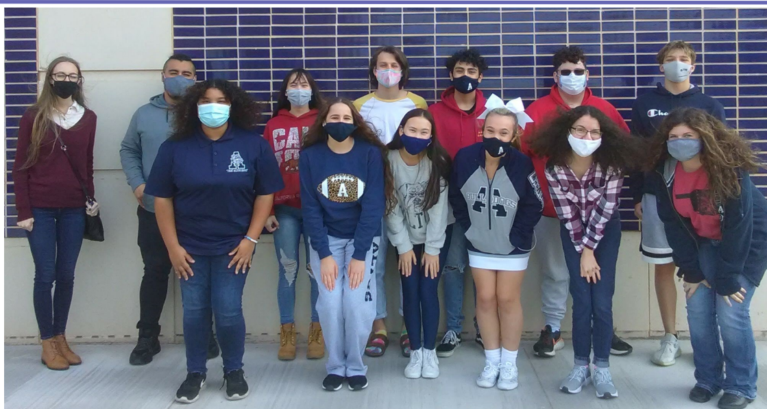
All-Region Choir Members.

The Southwest Oklahoma All-Region Honor Choir gives students the opportunity to perform in a choir at a different level as well as to prepare them for the All-State audition process.