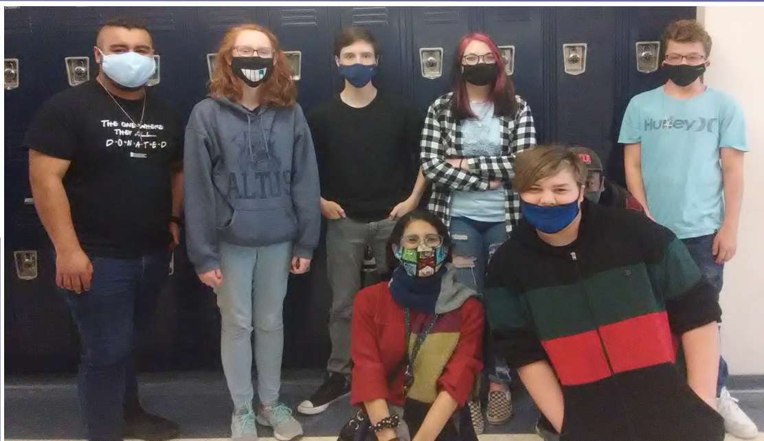
AHS Drama Club Members.

The AHS Drama Club was created to educate students in the performing arts such as acting, public speaking, and debate.