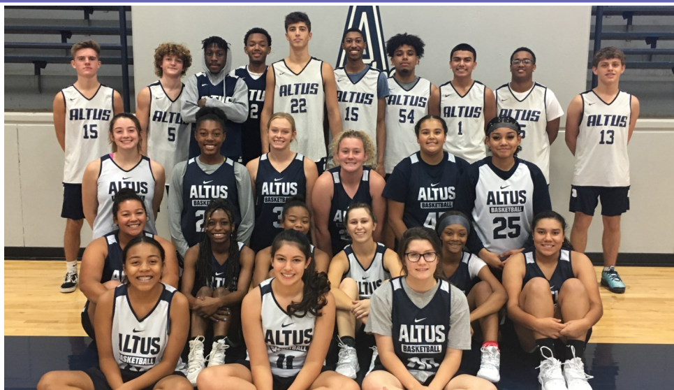
Bulldog and Lady Bulldog Basketball Teams.