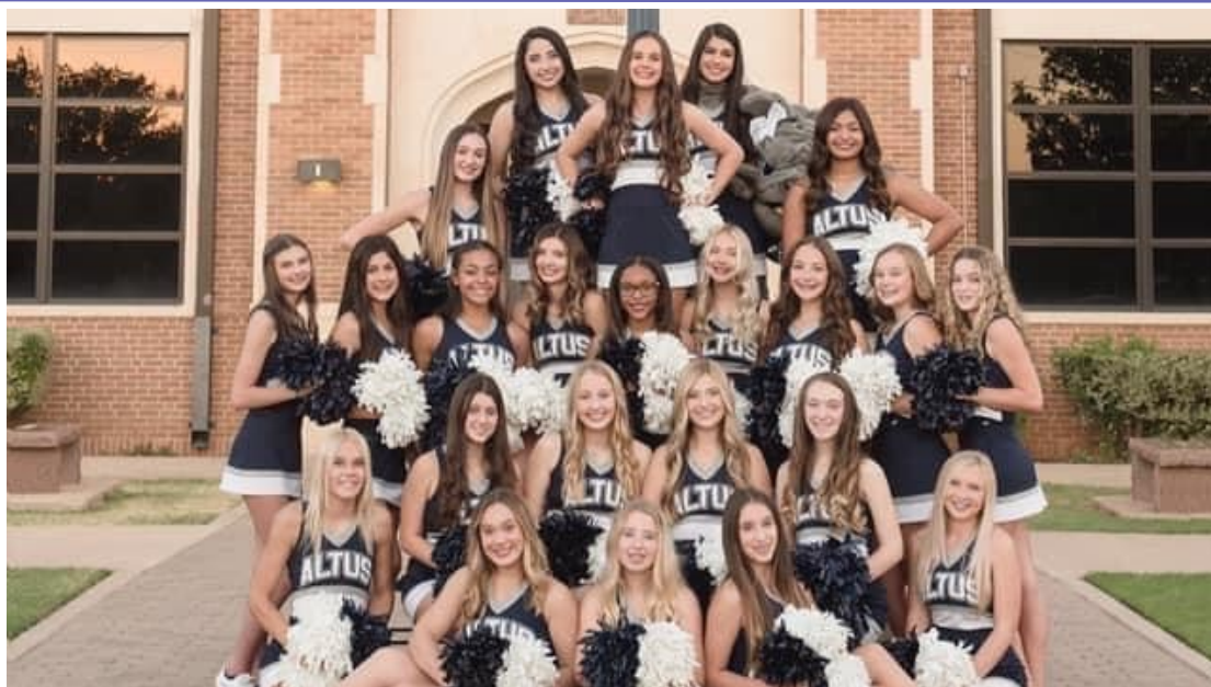
AHS Cheer 2020-2021.

The Altus High School Cheerleaders won the 5A game day State Championship by two points over 14 other big name schools in the state. This is the first year that the AHS cheerleaders have won state.