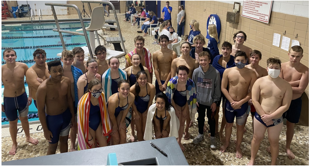
The Bulldog Swim Team at their meet last weekend.

Some of the difficulties that the swim team has experienced this year are that many of the meets are limited to only a small amount of people due to Covid-19 precautions. Right now, parents are only allowed to watch the meets, and temperatures