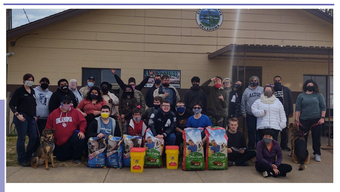
Students in front of Altus Animal Shelter.

The Life Skills Class of Altus High School went to The Altus Animal Shelter on Friday, January 29. They left at 10 a.m. and returned at 2:30 p.m..